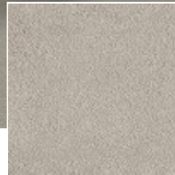
230 / Sweet Elegance / Flax